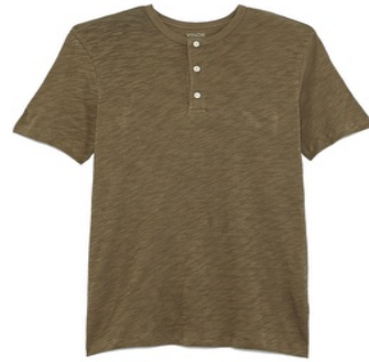
Henley 3-button style shirt – solid in color