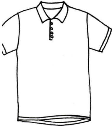
Polo shirt – solid in color