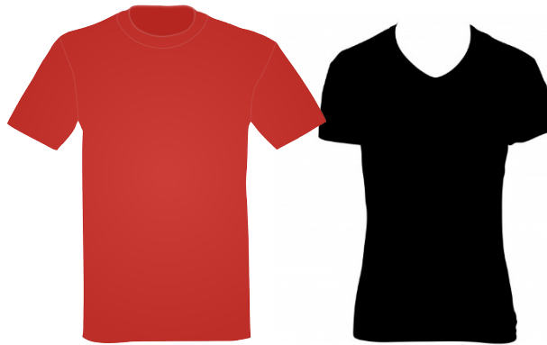
T-shirt (crew neck or v-neck) – solid in color