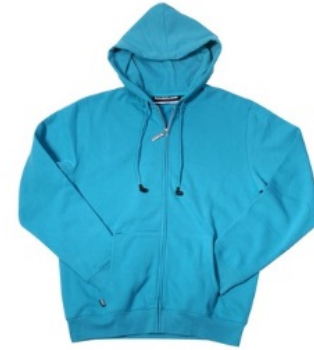
Hoodie must be SOLID in color – logo must be able to be covered by student's thumb